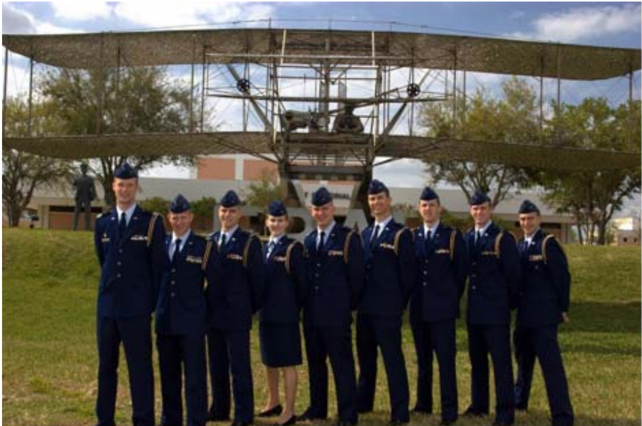
THE NATCOM STAFF

Please send your e-mail address to MHCummock@cfl.rr.com to receive our Chapter Newsletter and notices of meetings and events electronically and in color. This request is being made to help save the chapter funds for AFROTC & AFJROTC awards and scholarships.